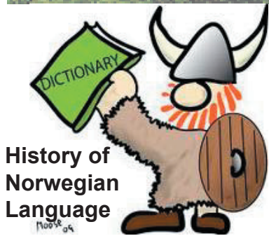
History of Norwegian Language