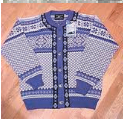
Bunad & sweaters