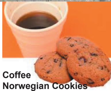
Coffee Norwegian Cookies