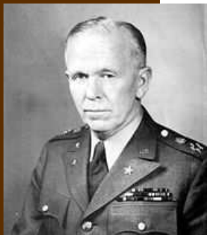
U.S. Secretary of State and 1953 Nobel Peace Prize Recipient, George Marshall

Looking for a travel companion for that next trip to Norway or North Dakota? Why not ask one of your fellow Desert Fjord members?